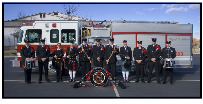
Coeur d'Alene Firefighters Pipes and Drums